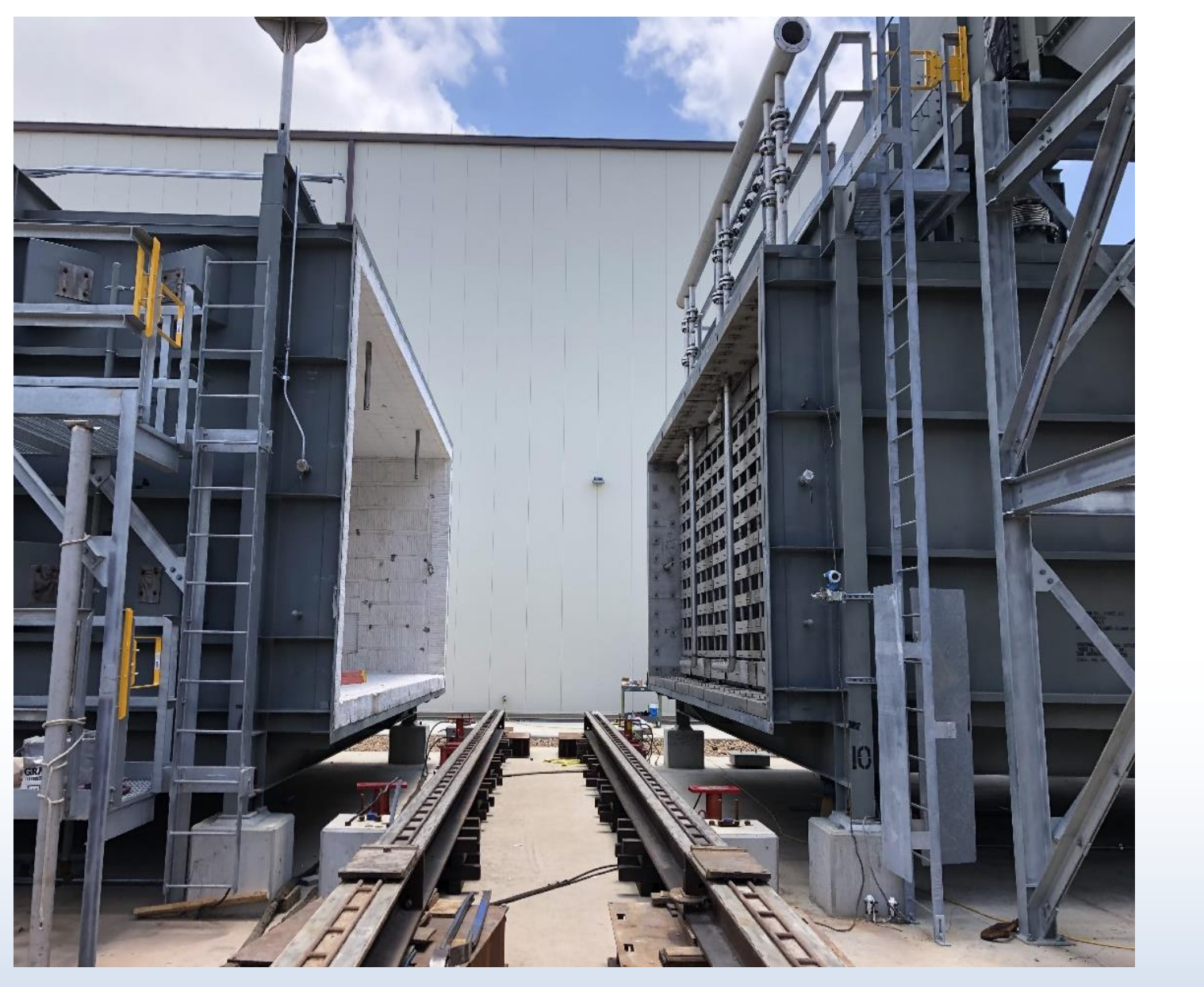
Heater Coil Installation