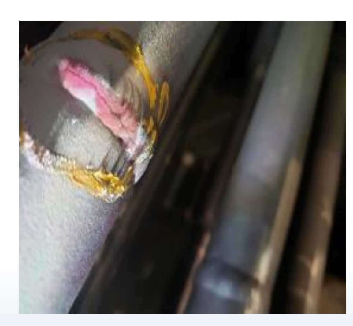
Typical Weld Crack after PWHT