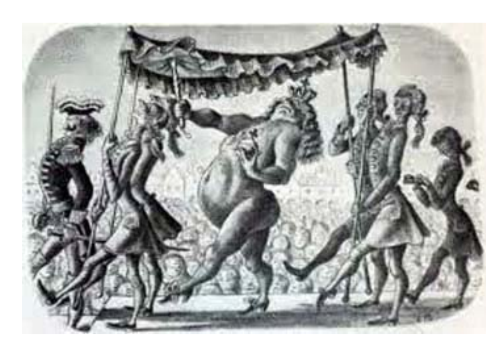
"But he has nothing on at all!"